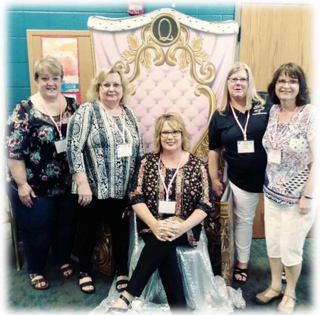
Members of the Owatonna Eagles #1791 Ladies Auxiliary were recognized with a "Sparkle" award for their Membership Net Gain of 4.21% for 2019! Congratulations ladies on your achievement!!

Below is an outline of recent Charitable Donations sent on behalf of the Eagles #1791 Ladies Auxiliary for 2019. As you can see, these donations benefit many different organizations and our goal is to keep these as localized as possible.